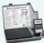
PROGRAMMABLE REFRIGERANT CHARGING SCALE