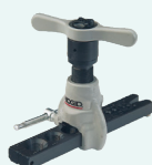
RATCHET FLARING TOOL